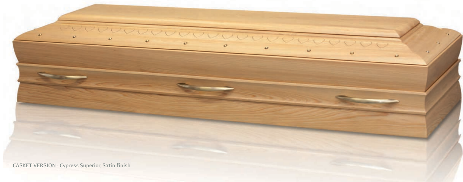
CASKET VERSION - Cypress Superior, Satin finish