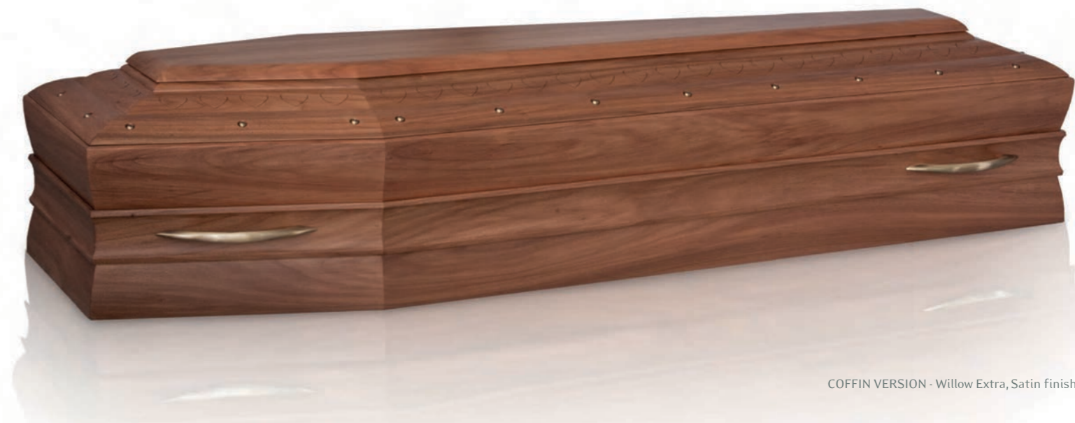
COFFIN VERSION - Willow Extra, Satin finish